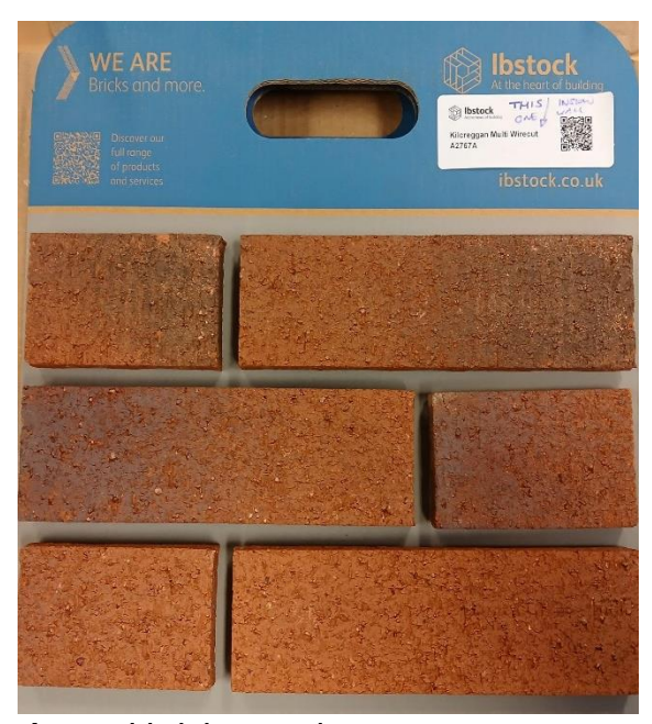
Agreed brick sample

The proposed brick to be used is 'Ibstock Kilcreggan Multi Wirecut A2767A – Red' shown below: