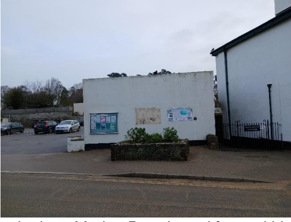
View of the garages from the north and south along Marine Parade and from within the car park. Access to Quay Cottages to remain in situ.

The car park is within the Historic core of Instow Conservation Area, bounded by a Grade II listed building at Orchard House to the north and Torridge View and Quay Cottage to the south.