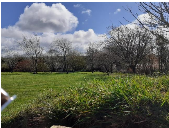
Site from the Highway

The site is located outside of Patchole. Patchole is made up of a selection of dwellings centred around the road junction. The site is accessed from an unclassified road, with the land at a higher level from the road and enclosed by established hedgerows. The site appears to have been used for recreational purposes with a summer house and formal planting having taken place on site.