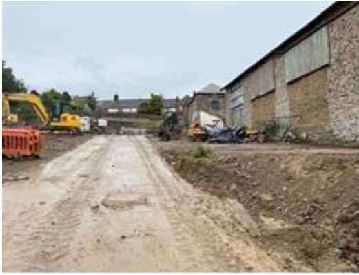
Views from south facing northwards (the Nicholls Shed)