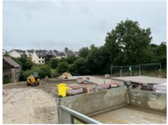
Views towards south of site