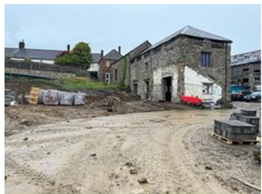
Views northeast facing north (The Apple Loft)