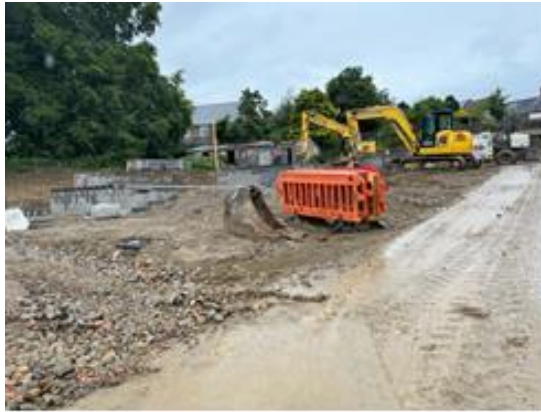
Foundations laid for proposed dwellings to west of site