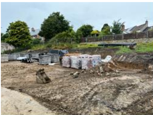
Land to north

At the time of the site visit it was evident that works had commenced on site and a number of foundations had been laid for the proposed dwellings. And the site is currently being developed in accordance with planning permissions 70262 and 70263.