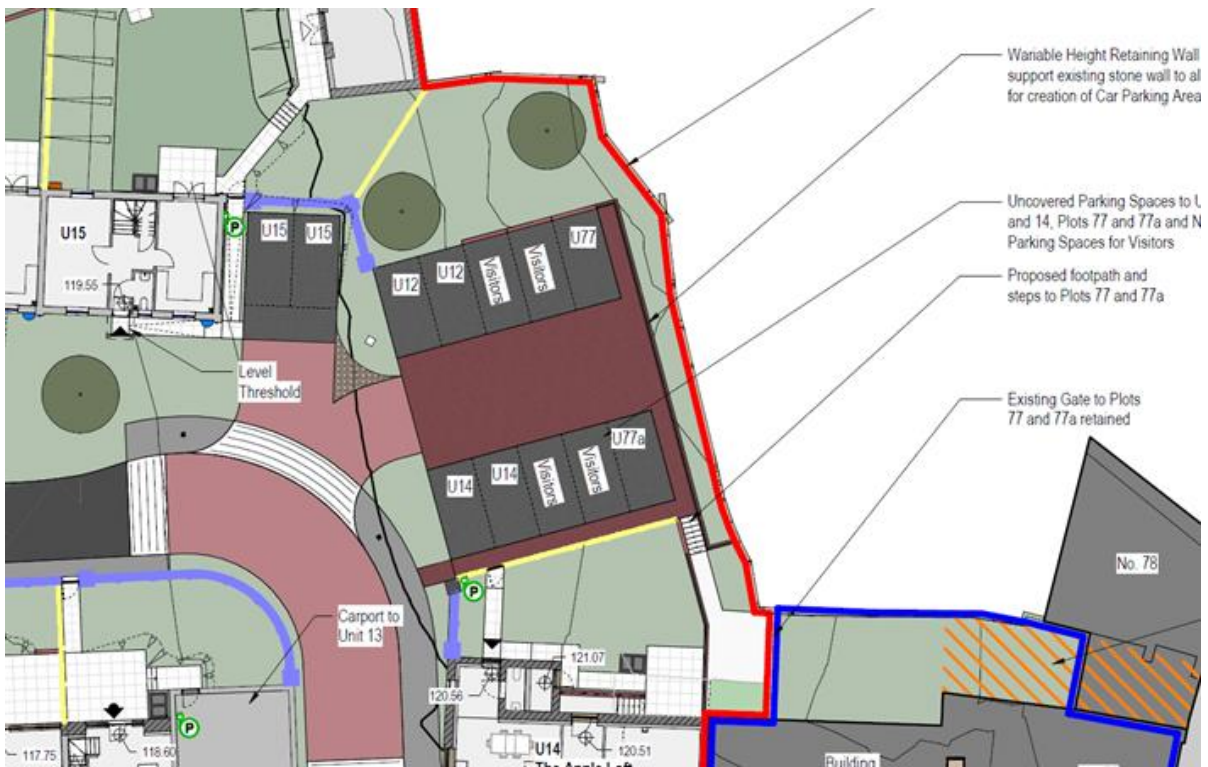
Enlarged site plan as approved under 70262 showing original visitor spaces