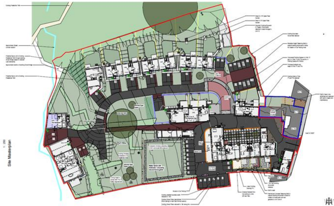
Site plan as approved under 70262

The original plans as approved showed two parking spaces for each new dwelling plus four visitor spaces. In addition 1 space each was shown for number 77 and 77a with an internal path allowing access to the rear of no 77.