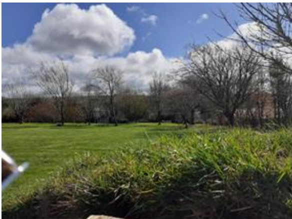
Site from the highway

The site is located part of the cluster of development at Patchole made up of a selection of dwellings centred around the road junction. The site is accessed from an unclassified road, with the land at a higher level from the road and enclosed by established hedgerows. The site appears to have been used for recreational purposes with a summer house and formal planting having taken place on site.