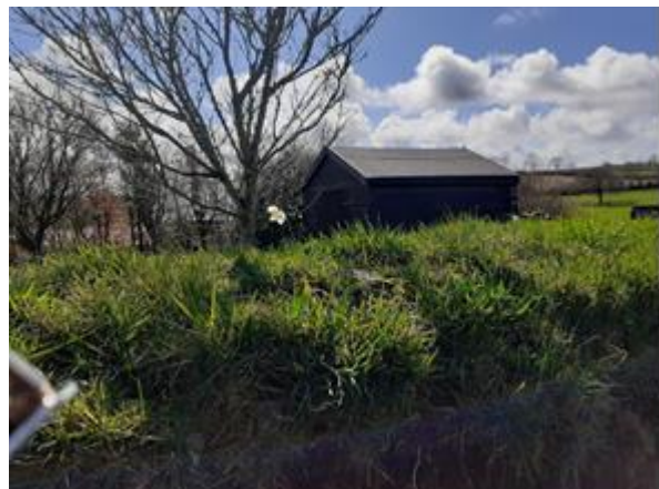
Existing shed on site