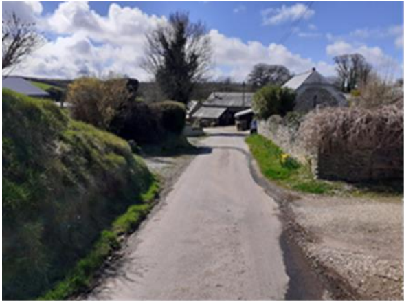
Access and highway