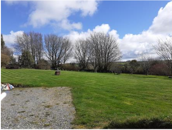
From driveway looking east