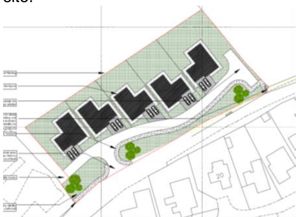
Indicative site plan proposed

The proposed design, scale and layout will be a reserved matter for consideration at a later stage. The application has been supported by an indicative site plan which shows that the units, road, parking, turning area and planting can be easily accommodated within the site.