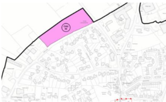
Site allocation as shown in Local Plan