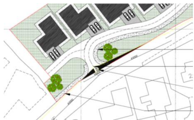
Access plan proposed