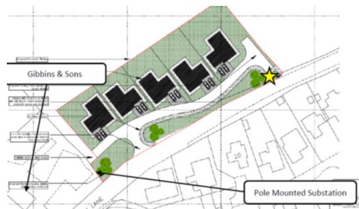
Plan showing adjacent commercial use and substation

Following the public consultation the Environmental Health Officer has raised some concerns over the noise impact from the adjacent Electric Substation. These can produce significant noise, including low frequency tonal noise, which could impact occupiers of nearby dwellings. The applicants have since submitted a noise assessment.