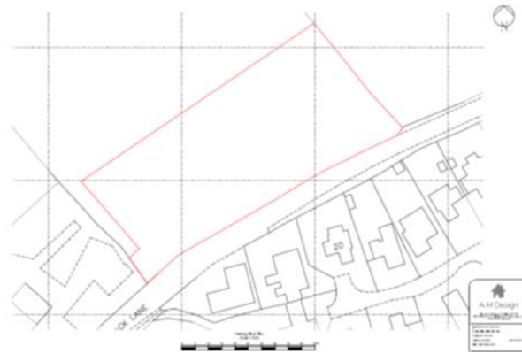
Proposed site area on western part of allocation

The principle of residential development on this land is therefore accepted in accordance with the above.